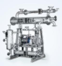
Multi-stage steam jet vacuum systems

Condensers designed as mixing and surface condensers for process engineering applications