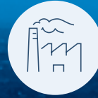
WASTE GAS CLEANING