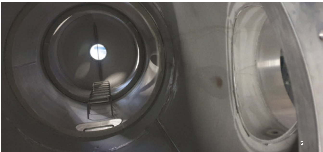
The inside of a vacuum scrubber without fittings

Glycol scrubbers don't just remove condensable vapours, but also finely dispersed droplets and sticky aerosols before they precipitate. Ice condensers and cold-water surface condensers reliably condense solvents, crystallising substances and high-boiling organic vapour. They are ideal for chemical and pharmaceutical processes. Hot or cold separating systems control whether and where media containing wax or resin suddenly harden or become very viscous when the temperature drops.