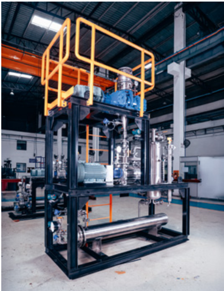
A fully mechanical Körting vacuum pump system including the roots blower and a closed loop liquid ring vacuum pump system.