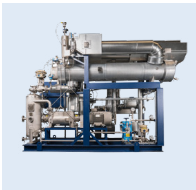
Energy-efficient turnkey vacuum system