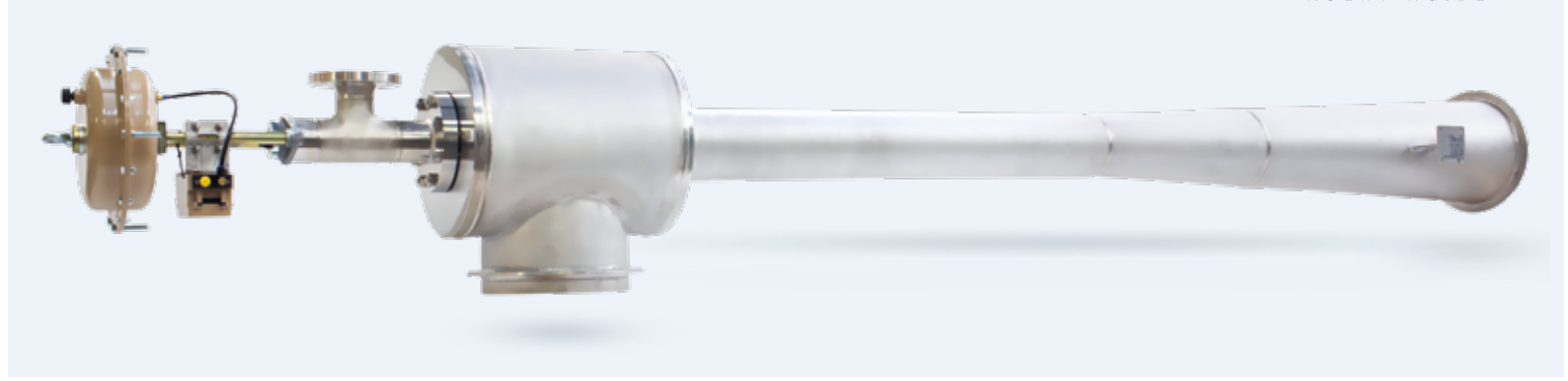
Körting steam jet compressor with nozzle needle control