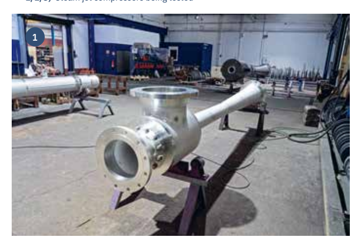
1/2/3) Steam jet compressors being tested

This steam is released in a motive nozzle to bring it up to the maximum speed. The nozzle outlet pressure drops to allow suction of the steam to be compressed. Both flows converge in the downstream mixing section. When the two flows are mixed, some of the motive flow's kinetic energy transfers to the suction flow. The mixed flow is then slowed down in the subsequent diffuser and a pressure gain occurs at the same time. This steam mixture is used in the process downstream at the higher pressure level.