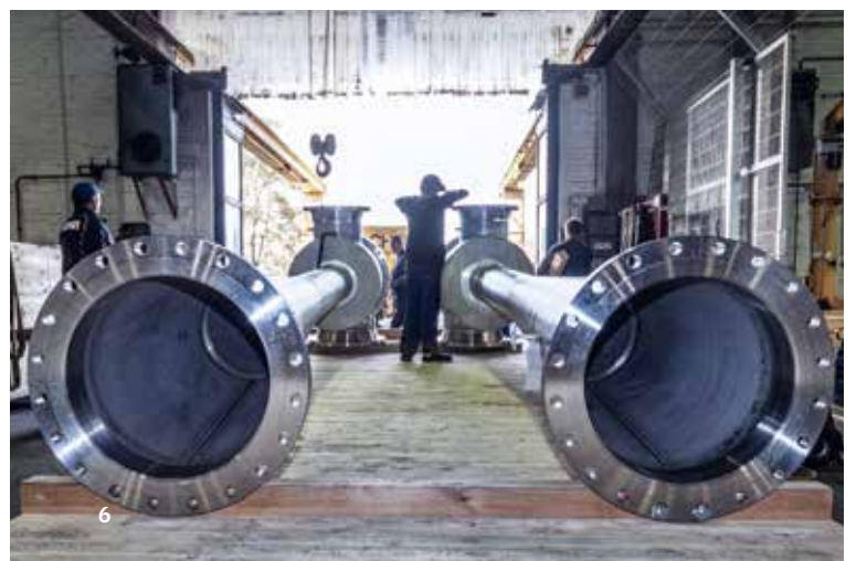
Körting steam jet compressors being loaded